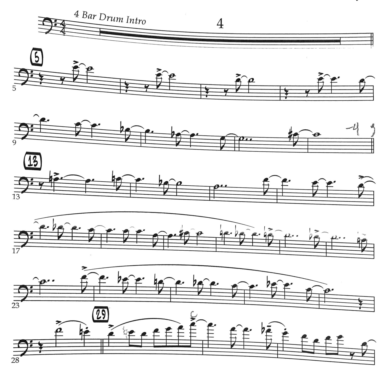
Copyright © 2006 Brookmeyer Music, BMI